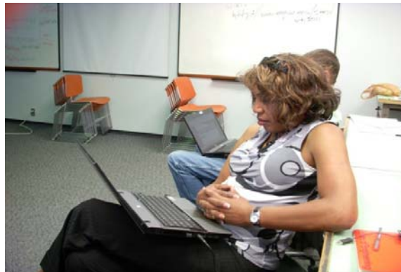
Two RET Participants Studying the Wiki

RET Participants immediately dived into changing username and password. This process was made simple by selecting Register under the Special Section. In this section, Wiki selects a password and email it to the participant's email address. The password designed by Wiki is a computer generated, very strong, and nearly un-hackable password; which the participant copied and pasted into the password request selection. Once Wiki is officially opened, participants moved quickly to the Profile section and created a new password and updated the Profile.